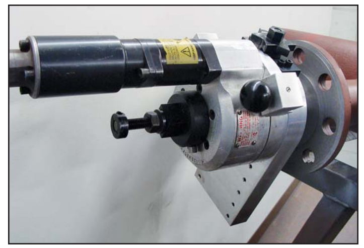
Mactech's Mini Flange Facer